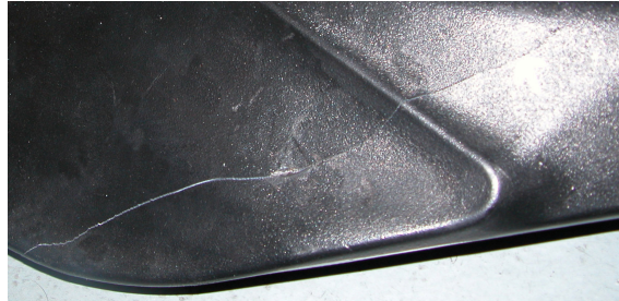
Impact Damage - Cracked snorkel body from a blow that barely marks the surface of a genuine Safari snorkel.

Put simply, the inferior Chinese manufactured copy product cannot be relied upon to deliver the level of component performance and durability that Safari customers have enjoyed for over three decades. Regardless of cost, there is no peace of mind with inferior products.