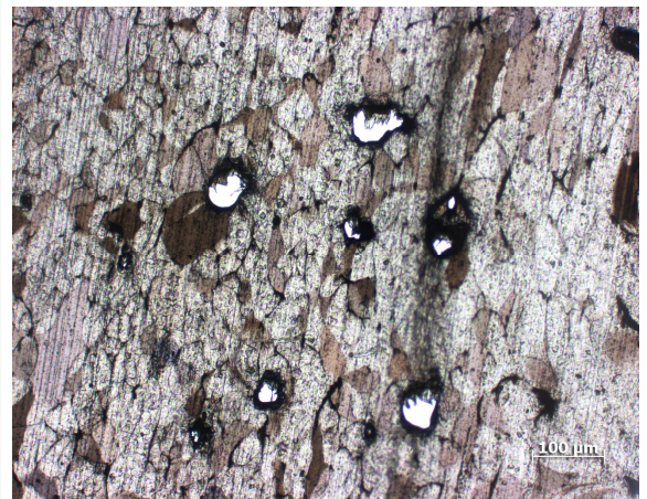
Chinese Copy Snorkel Material - distinctly grainy or crystal like structure where additive and colouring agents simply coat the base material. Consistency varies markedly throughout the part.

Under the microscope, the cheap Chinese snorkel material displays a distinctly grainy or crystal like structure where the additive/colouring agents simply coat the base material – rather than combining in a homogeneous structure.